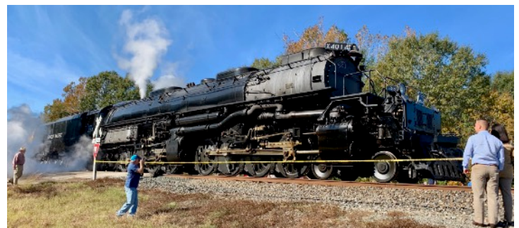
Big Boy No. 4014 in Troup, Texas, November 10, 2019