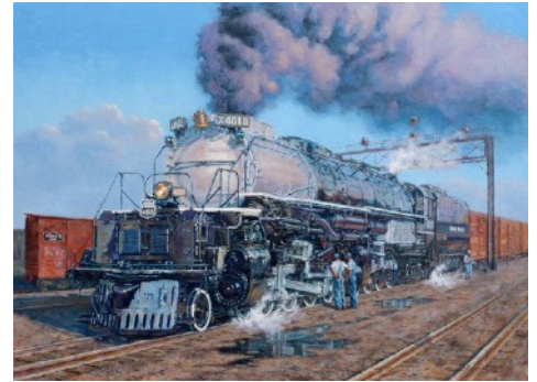
Painting by Sonya Terpening

The world's largest operational steam locomotive is currently making a historic tour across the Southwest United States. In honor of the 150th anniversary of the Transcontinental Railroad, Big Boy No. 4014 is completing "The Great Race Across the Southwest" and passed through Texas this November.